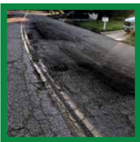
Damaged roads and sidewalks require repairs