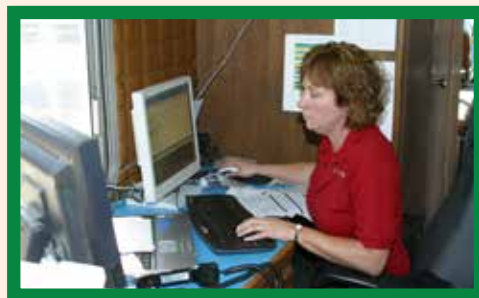
Police operating out of temporary portable trailers