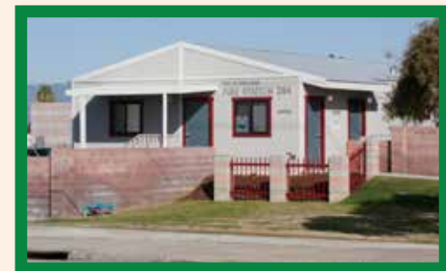
Fire Station 264 has been housed in a mobile home for the past decade