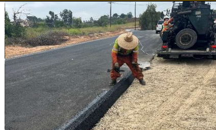
Installing asphalt dike on Fairmont Dr.

There is a variety of work currently being done throughout the City associated with this project. Residents should expect minor delays. Drivers should adhere to posted signs and use proper precautions. If restricted parking is necessary, "No Parking" signs will be posted 48 hours in advance of construction activities.