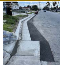
Completed Curb and Gutter

The Contractor is currently on schedule lowering manholes in various locations in the City. Construction notices have been given to affected residents. If restricted parking is necessary, "No Parking" signs will be posted 48 hours in advance of construction activities.