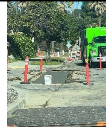
Cross Gutter Replacement

The Contractor is currently on schedule with replacing concrete curb and gutter, potholing, and lowering manholes in various locations in the City. Construction notices have been given to affected residents. If restricted parking is necessary, "No Parking" signs will be posted 48 hours in advance of construction activities.