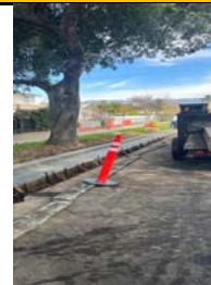
Curb and Gutter Replacement

The Contractor is currently on schedule with replacing concrete curb and gutter, and potholing in various locations in the City.