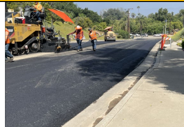
Contractor paved Marvin Avenue

There is a variety of work currently being done throughout the City associated with this project. Residents should expect minor delays. Drivers should adhere to posted signs and use proper precautions. If restricted parking is necessary, "No Parking" signs will be posted 48 hours in advance of construction activities.