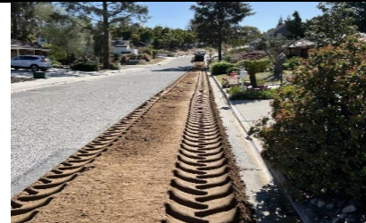
Pulverization on Camelot Dr

There is a variety of work currently being done throughout the City associated with this project. Residents should expect minor delays. Drivers should adhere to posted signs and use proper precautions. If restricted parking is necessary, "No Parking" signs will be posted 48 hours in advance of construction activities. The Redlands Bicycle Classic will not be affected by this project.