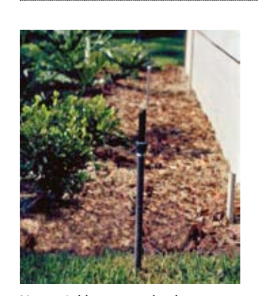
Use sprinklers or garden hoses regularly to keep vegetation moist.