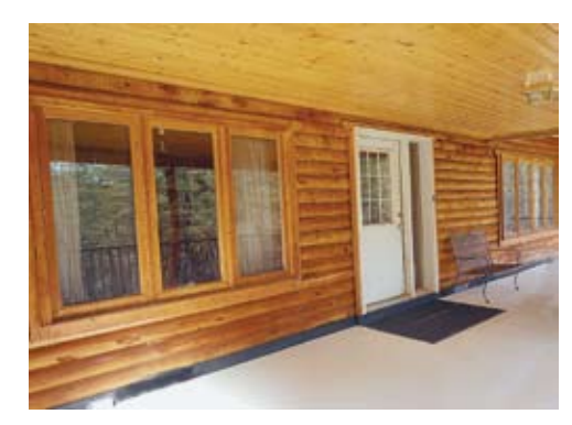
Use a concrete patio instead of a wooden deck and rubber mats instead of natural fiber.