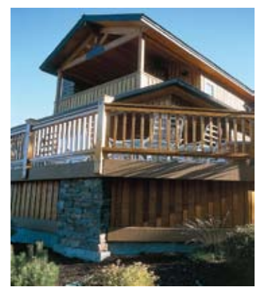
Enclose under decks so firebrands do not fly under and collect.