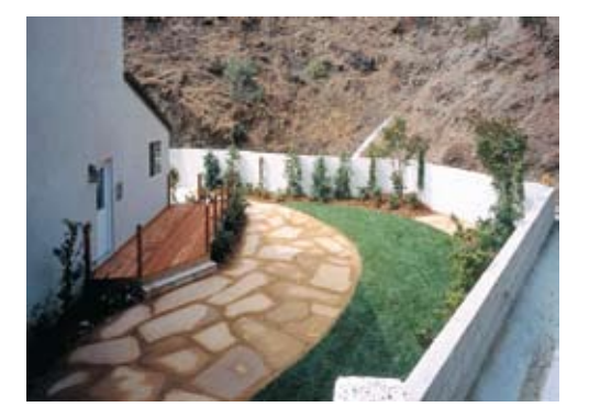
Create a cinder block wall around the perimeter of your yard and use grass and slate to break up the landscape.