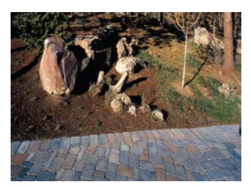
The use of pavers and rock make for a pleasing effect and creates a fuel break.