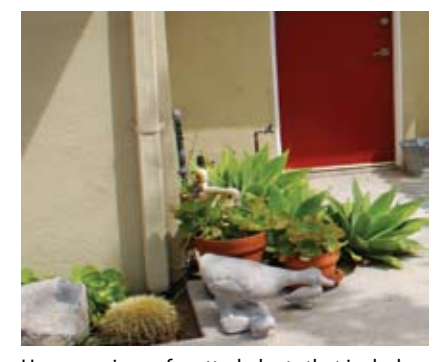
Use groupings of potted plants that include succulents and other drought resistant vegetation.