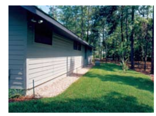
Use pebbles instead of mulch near the home's foundation where possible.