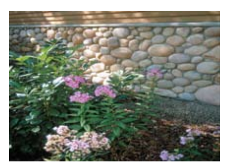
Use faux brick and stone finishes and high-moisture-content annuals and perennials.