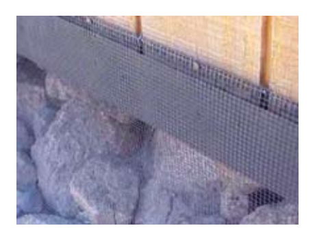
Cover openings with 1/8" metal screen to block fire brands and embers from collecting under the home or deck.