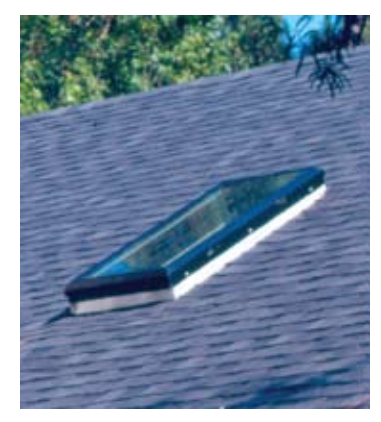
Use glass skylights; plastic will melt and allow embers into the home.

"When considering improvements to reduce wildfire vulnerability, the key is to consider the home in relation to its immediate surroundings. The home's vulnerability is determined by the exposure of its external materials and design to flames and firebrands during extreme wildfires. The higher the fire intensities near the home, the greater the need for nonflammable construction materials and a resistant building design." – Jack Cohen, USDA-Forest Service