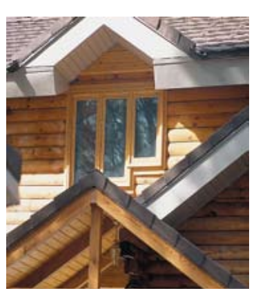
Enclose eaves and soffits.