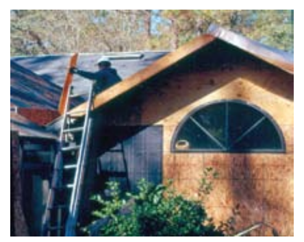
The roof is the most important element of the home. Use rated roofing material.