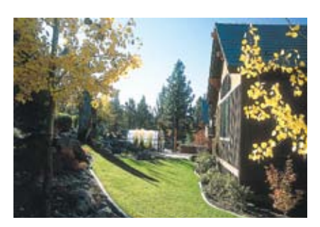
Use grass and driveways as fuel breaks from the house.