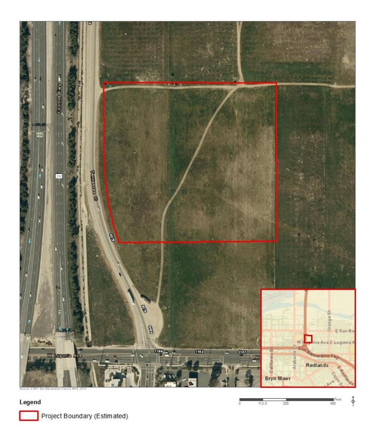
Figure 3. Project Location Tennessee Village City of Redlands