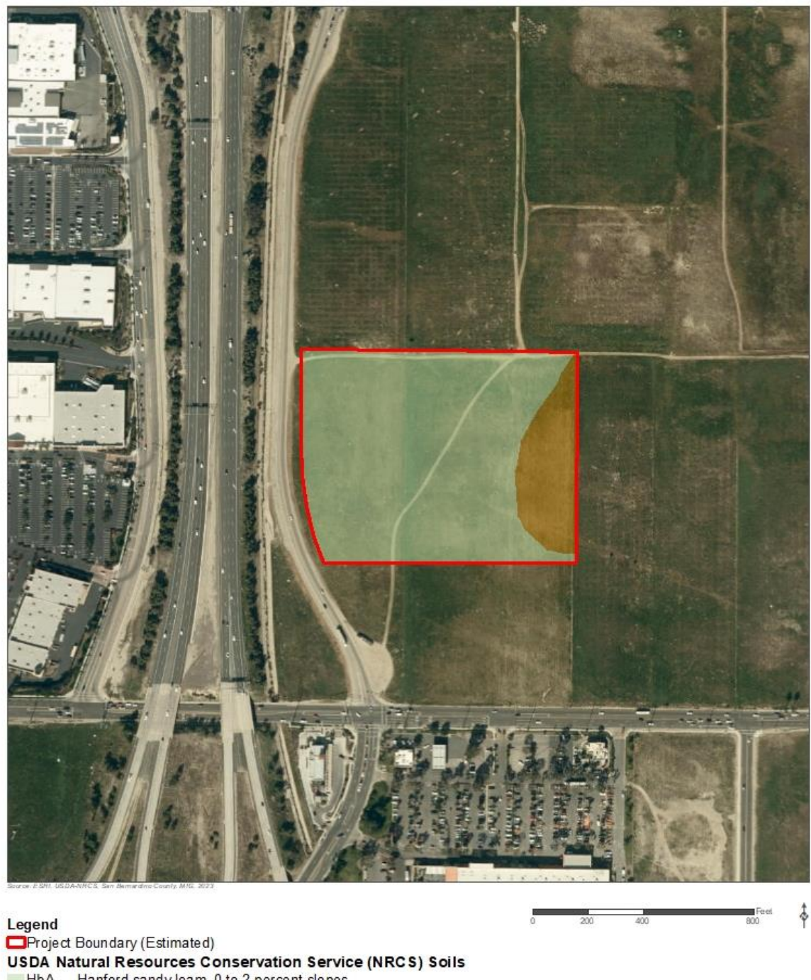
Figure 4: SSURGO Soils Map

HbA- Hanford sandy loam, 0 to 2 percent slopes TuB - Tujunga loamy sand, 0 to 5 percent slopes