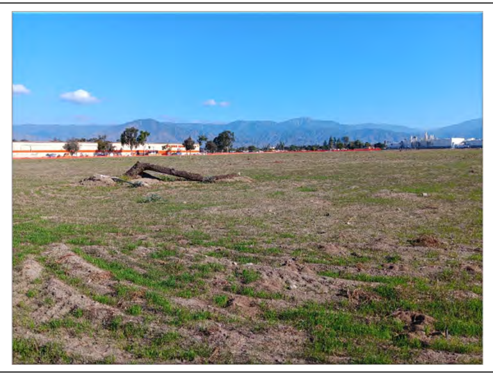
Photograph 1: Evidence of recent discing, view to the northeast.