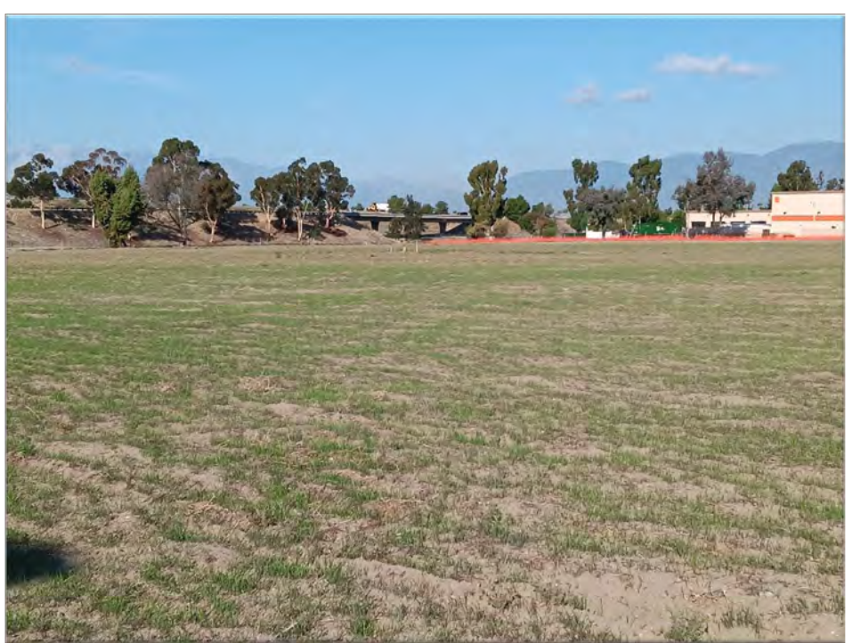
Photograph 2: Lowgrowing grass 30-80% visibility, view to the northwest.