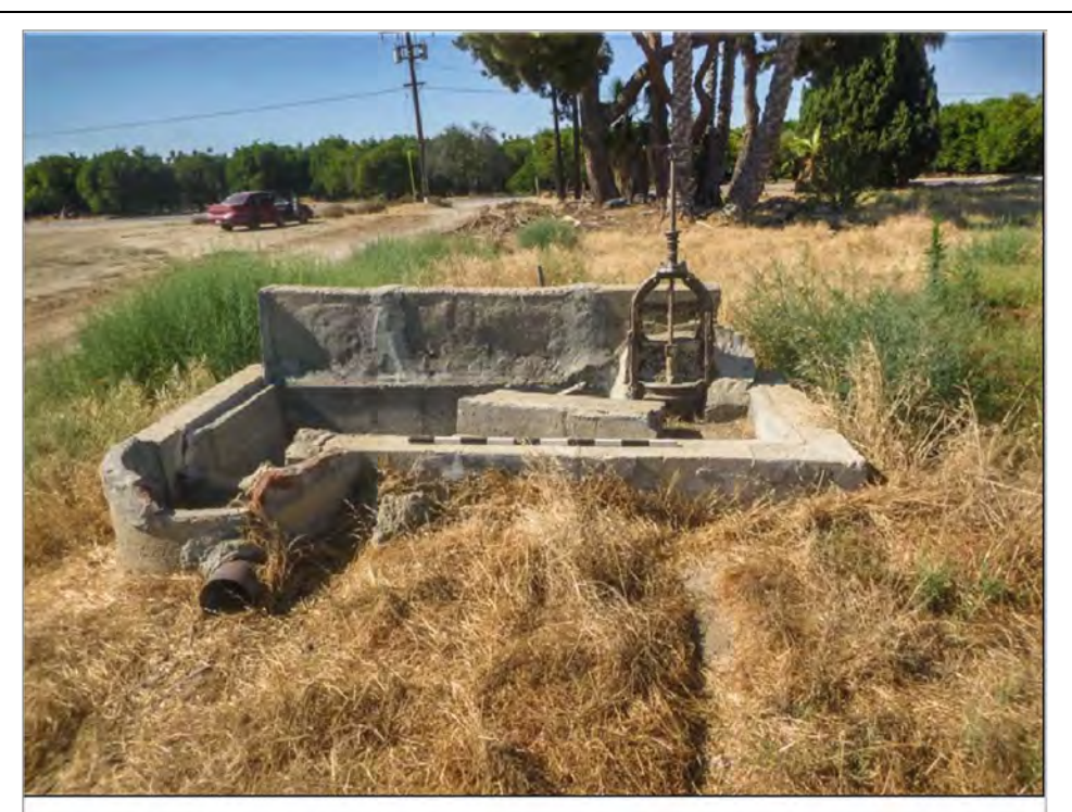
Figure 5-4 Overview of weir (Æ-3895-2H) view looking south.

Photograph 11: Weir and flume structures documented in the Redlands area. Note red brick and mortar construction. Also note metal gate surround inset into hand-formed concrete mortar.