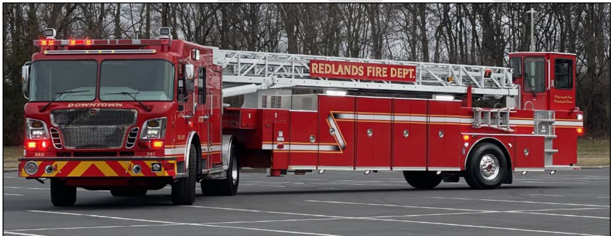
Brand new Redlands Fire Ladder Truck

In terms of public infrastructure, there are several areas in which Measure T has been invested: tree trimming, street & signal light repair, ball field maintenance and construction of new ball fields, general park repairs, restriping of streets and crosswalks, and ADA ramp and sidewalk replacement.