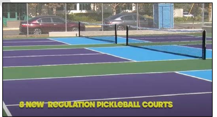
Tennis Court to Pickleball Court conversion – before & after