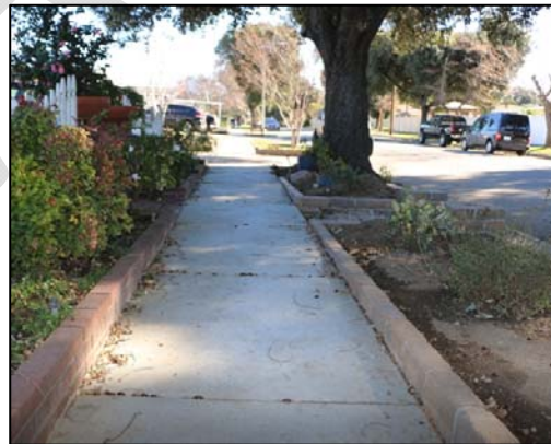
Sidewalk Replacement Project

Lastly, Measure T enabled investment into enhancing and restoring certain ‘quality of life’ service levels for the community. Some examples of this include: