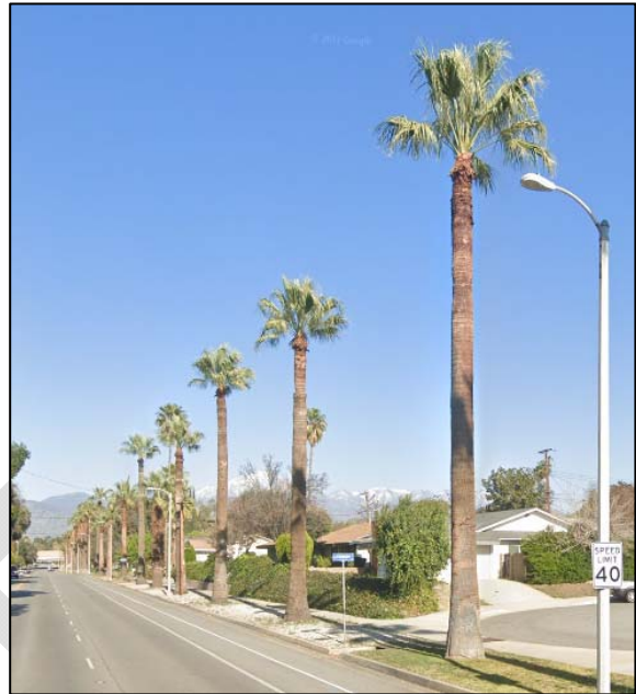
Tree Trimming Efforts – before & after (Cypress Ave.)