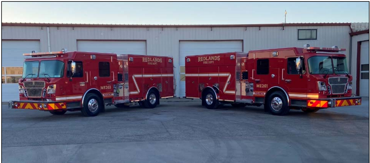
Two brand new Redlands Fire Type 1 Engines

delivery of the tractor-drawn aerial engine by April 30, 2023. In addition to funding to purchase the fire engines, funding to hire a deputy fire marshal and a fire prevention inspector was also authorized.