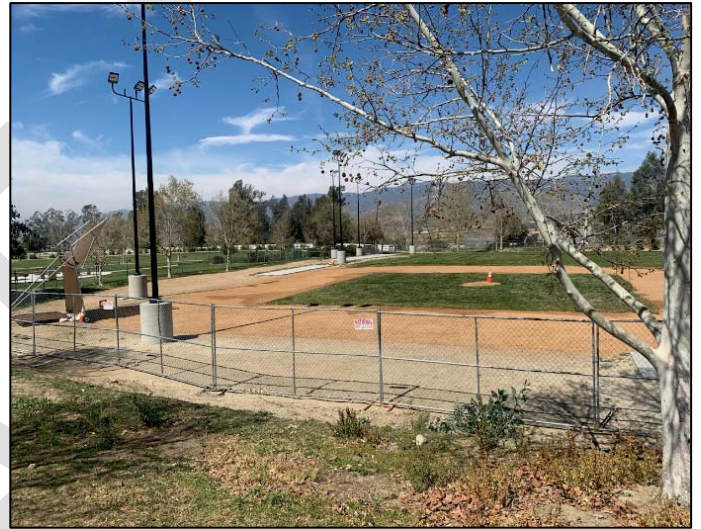
Israel Beal Baseball Field construction – before & after