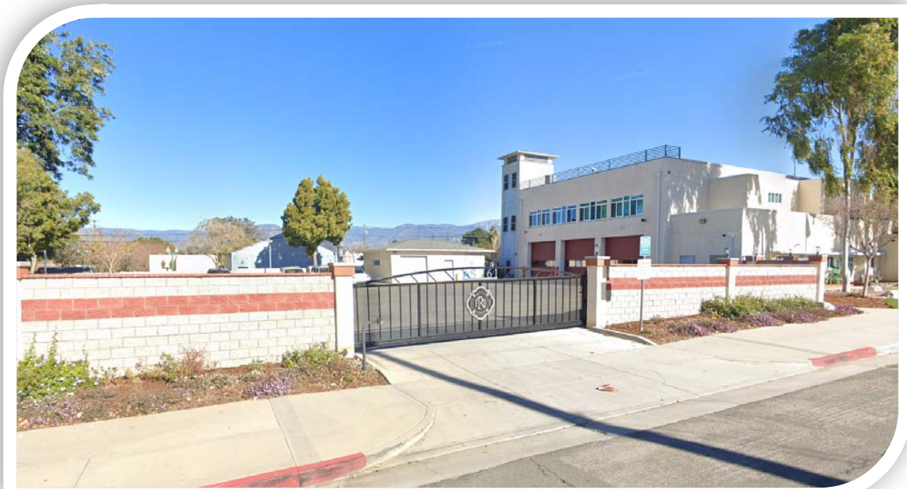
Fire Station 261 After Security Fence & Gate