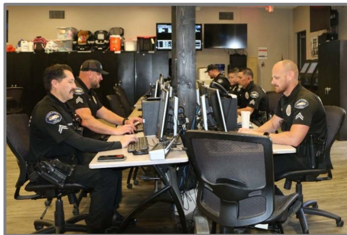
Officers at report writing desks

Looking over Figure 2 provided on the preceding page (page 4), public safety needs received a total of approximately $8.8 million in Measure T funds. The Police Department received funding for restoring and enhancing roughly 28 positions within the department. This included 5 police officer positions that were restored after budgets were cut in the midst of the COVID-19 pandemic and an additional 2 officer positions that were added to enhance staffing levels. In addition to this, 14 new vehicles were received and 11 of these replacements are for existing patrol vehicles. Also, the outfitting and gear needed to commission these new vehicles was also funded through Measure T. The Police Department also received funding for several software integrations between their existing computer-aided dispatch system and citation and GIS software products. Other specialized equipment included the purchase of updated SWAT response equipment, GPS trackers to combat organized retail crime and special forensic processing technology tools.