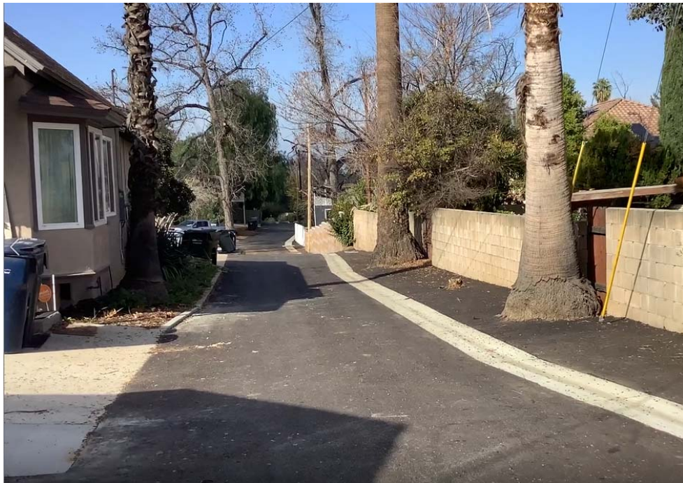
Alley Repaving Project – before and after on Steele Street

Lastly, Measure T enabled investment into enhancing and restoring certain ‘quality of life’ amenities and services for the community. Some examples of this include: