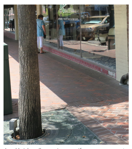
A red brick walkway gives a uniform appearance to the State Street commercial area.