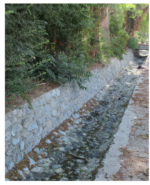
Stone-lined ditches and culverts are found throughout Redlands.