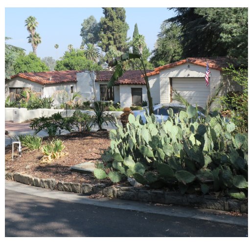
Mature trees or shrubs may be historic landscape features.