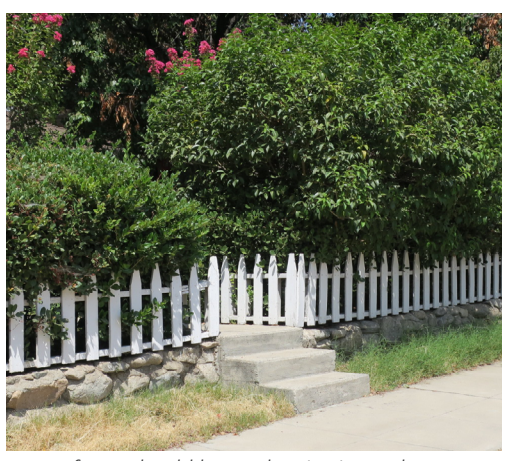
A new fence should be modest in size and appearance.