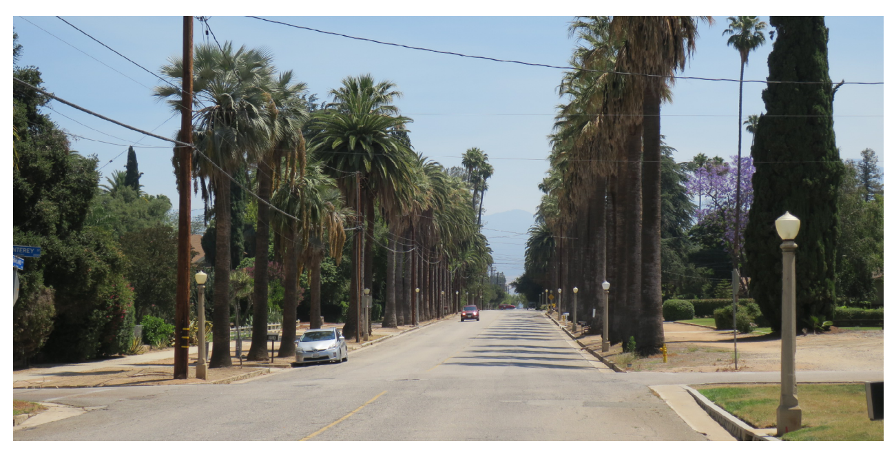
Mature trees and remnant citrus groves define portions of the city's streetscape. Note the alignment of a major corridor oriented toward a prominent mountain peak in the distance, and framed by rows of mature palm trees, which is an extant representation of the city's historic original street grid plan from the late 1800s.