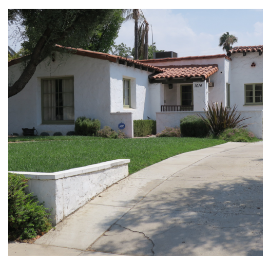
A low retaining wall painted to match the historic building is a compatible landscape alteration.