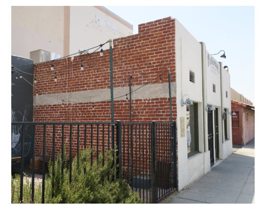
A metal fence defines the side yard of this commercial property.

This section addresses special considerations for historic commercial site features. In Redlands, these features may include landscaping, walkways, steps, patio, railings, driveways, parking lots, alleys, and service areas. These features are typically utilitarian, as compared to decorative site features of residential buildings, and they extend the function of the commercial building into the public sphere. Proper treatment of commercial site features is important to preserving the character and integrity of historic resources in Redlands. However, due to their secondary and utilitarian nature, there is greater flexibility in their treatment.