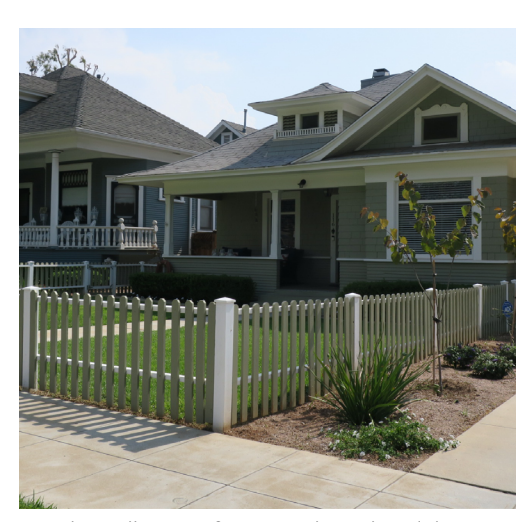
Avoid installing site features where they did not exist historically.