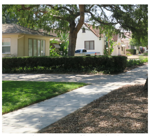
Maintain the proportions of historic hardscape to landscape.