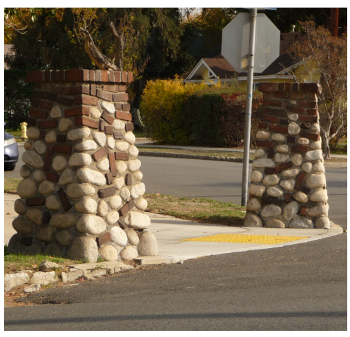
Stone pillars mark a historic subdivision entrance.

This section addresses the treatment of historic residential site features. In Redlands, these features may include trees, landscaping, fences, perimeter walls, retaining walls, walkways, steps, terraces, driveways, curbs, fountains, and freestanding mailboxes and light fixtures. These features may have been constructed during the same time as their associated historic building or added to the site at an early date. Their design typically relates to the main building in style, form, material, and finish, and often reflects specific adaptation to a topographical setting. These features extend the visual continuity of the house to the street. Similar to the main building, proper treatment of site features is important to preserving the character and integrity of historic resources in Redlands. However, due to their secondary, subordinate nature, there is greater flexibility in their treatment.