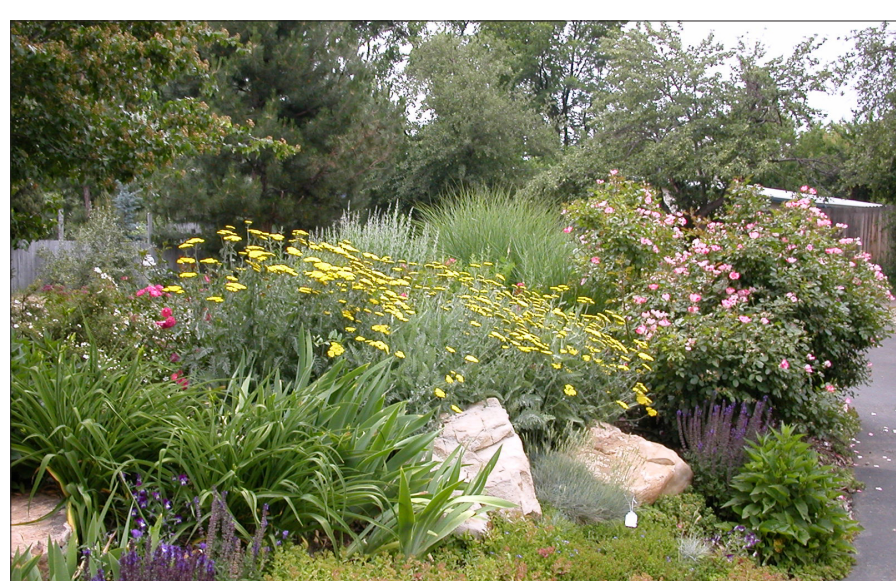
Drought tolerant landscaping.