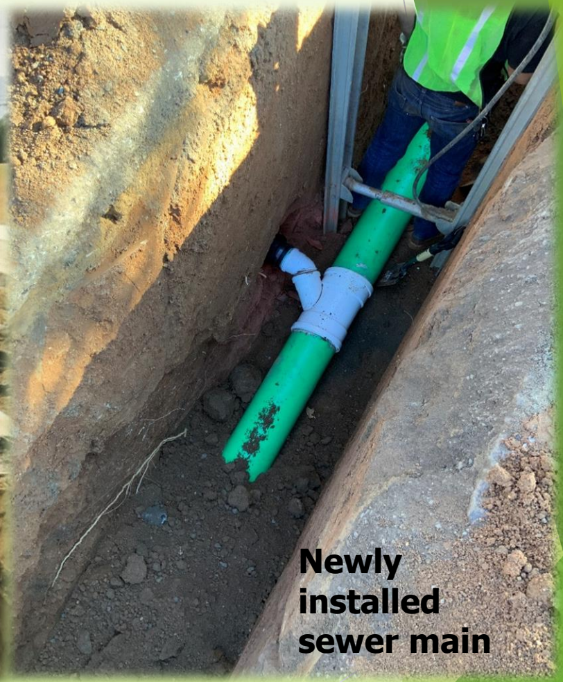
Newly installed sewer main