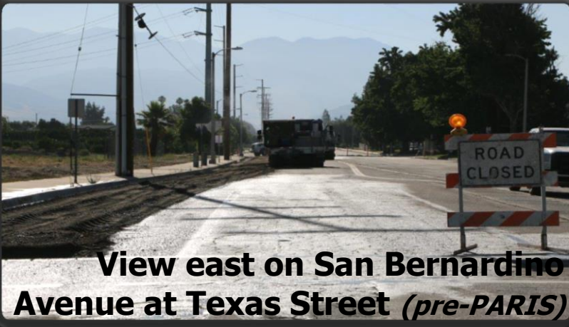
View east on San Bernardino Avenue at Texas Street (pre-PARIS)