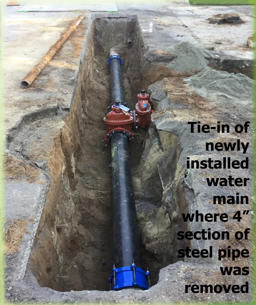
Tie-in of newly installed water main where 4" section of steel pipe was removed