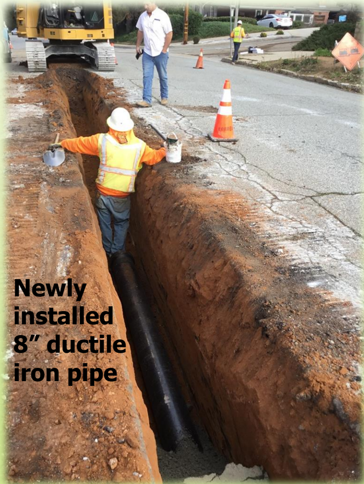
Newly installed 8" ductile iron pipe