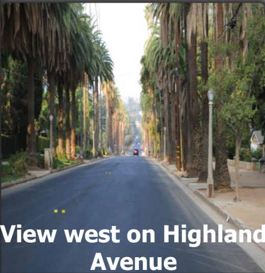
View west on Highland Avenue