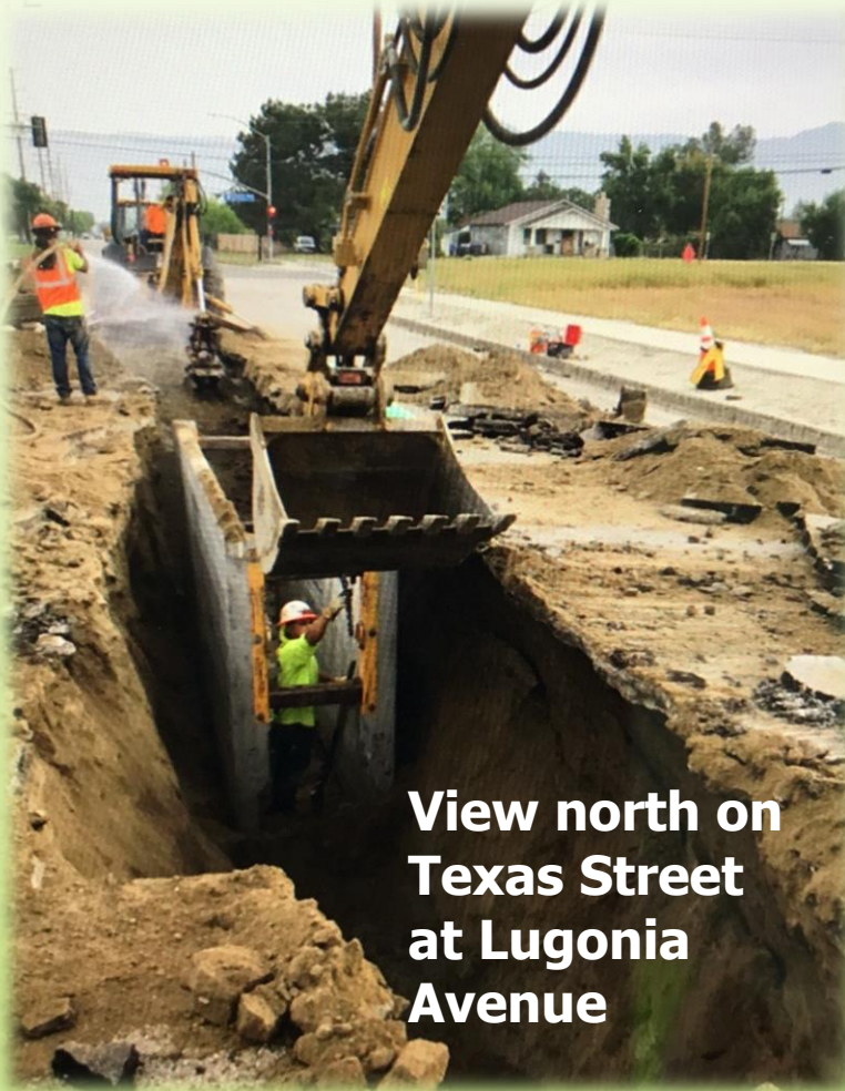
View north on Texas Street at Lugonia Avenue