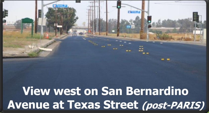
View west on San Bernardino Avenue at Texas Street (post-PARIS)