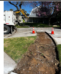
Demoing sidewalks on Dracena Ct.

Construction notices have been given to affected residents. If restricted parking is necessary, "No Parking" signs will be posted 48 hours in advance of construction activities.