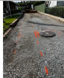
Propose v-gutter location for Alley #3.

Construction notices have been given to affected residents. If restricted parking is necessary, "No Parking" signs will be posted 48 hours in advance of construction activities. Alleys will be closed for 3 weeks.