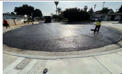
Slurry sealing on the cul-de-sac of Dale Ln.

There is a variety of work currently being done throughout the City associated with this project. Residents should expect minor delays. Drivers should adhere to posted signs and use proper precautions. If restricted parking is necessary, "No Parking" signs will be posted 48 hours in advance of construction activities.