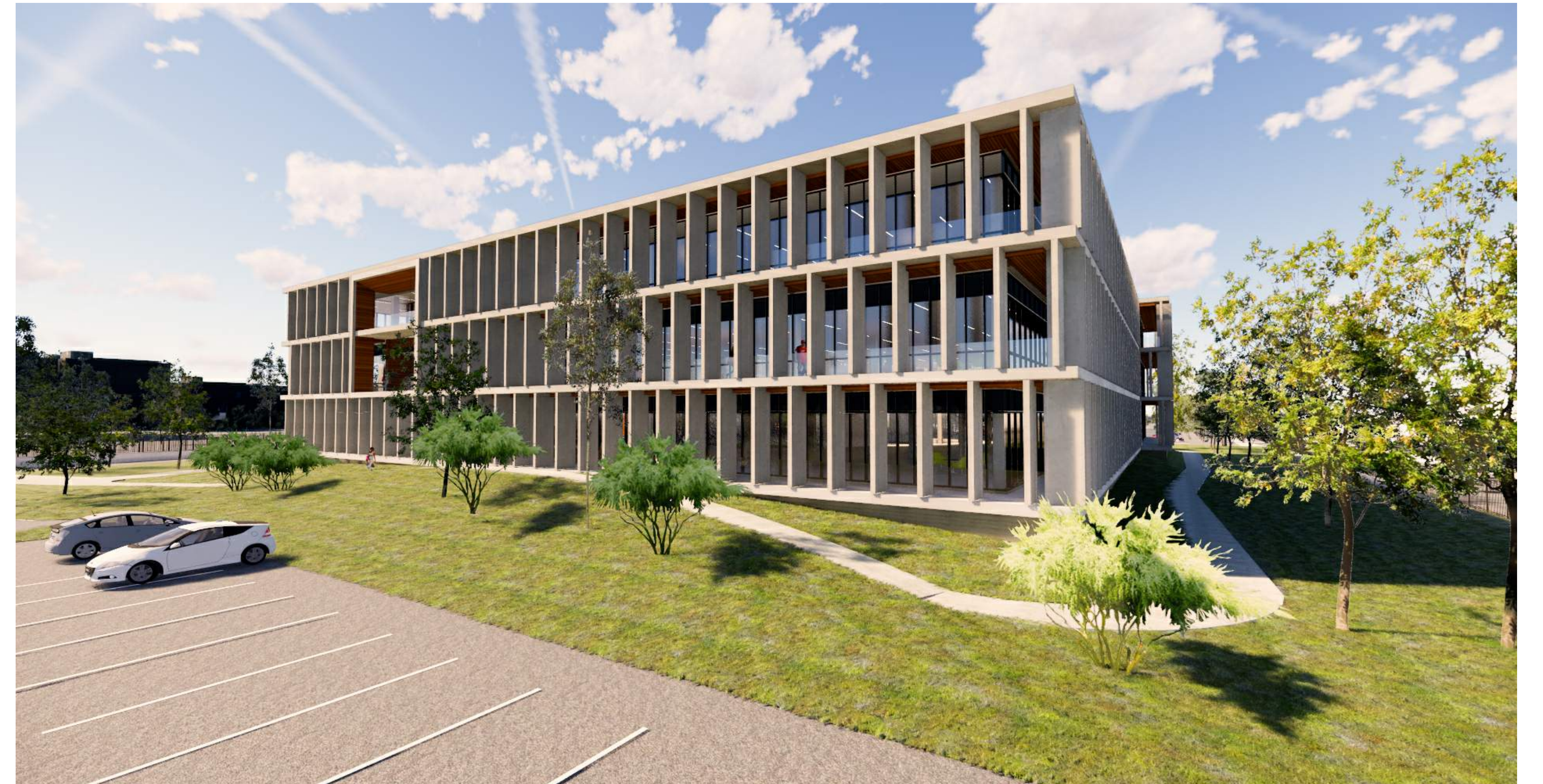
VIEW FROM PARK AVE