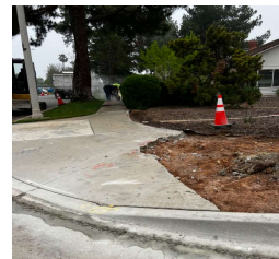
The contractor demoing ADA ramp and sidewalk on the SE corner of Lytle St. and Evergreen Ct.

Construction notices have been given to affected residents. If restricted parking is necessary, "No Parking" signs will be posted 48 hours in advance of construction activities.