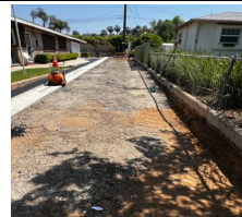
Preparing grade in Alley #3 to machine pave

Construction notices have been given to affected residents. If restricted parking is necessary, "No Parking" signs will be posted 48 hours in advance of construction activities. Alleys will be closed for 3 weeks.