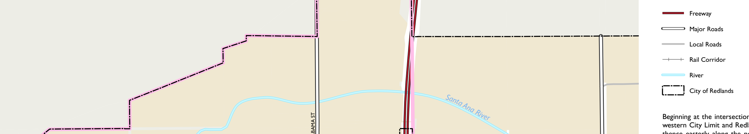
Figure 5-1: Donut Hole