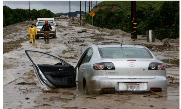
Do not attempt to walk, swim or drive through moving water or flooded areas as debris can be dangerous.