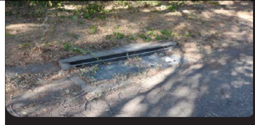
Leaves and debris can clog drains and cause flooding. Clear drain areas around your home before the rain starts. Check curbside gutters and drains, and if they are clogged, alert local officials or other responsible parties.