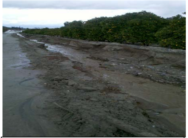
After a fire, vegetation that normally absorbs water is gone. Ash and debris can wash down and clog drainages causing flooding in areas below the fire.

In non-native landscaped areas, property owners may replace vegetation with appropriate fire-resistant, non-invasive plants. A local landscape professional can make recommendations for your particular area.