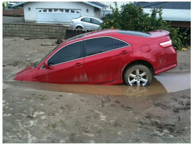
Two feet of water is enough to wash away a passenger vehicle.